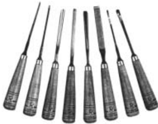
Set of eight carving tools